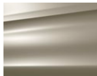
Golden White (metallic) 2