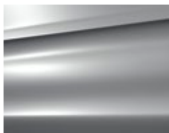
Arctic Steel (metallic)