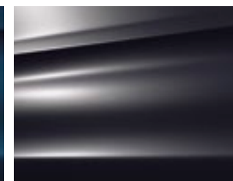
Gunmetal (metallic) 2