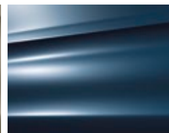
Kyanos Blue (metallic) 2