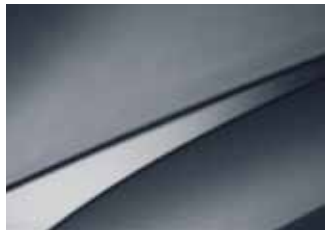
Iron Grey (pearlescent)