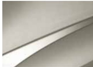
Golden White (metallic)