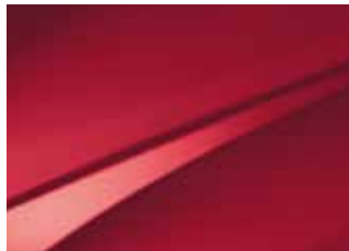
Deep Red (pearlescent)