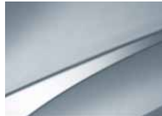
Lake Blue (metallic)