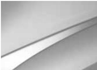
Arctic Steel (metallic)